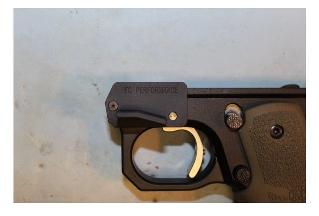
Be Safe and Have Fun©